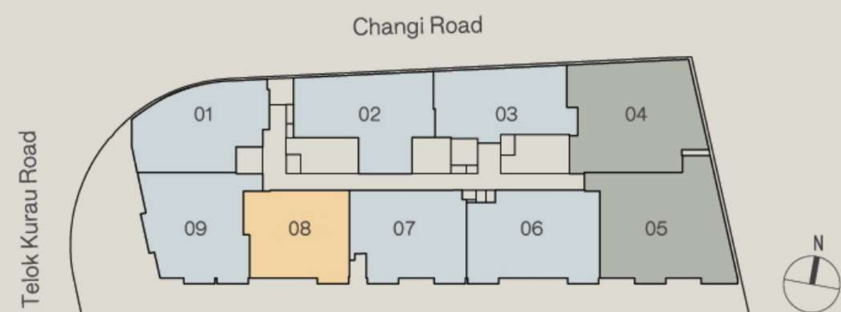
Typical Storey Key Plan