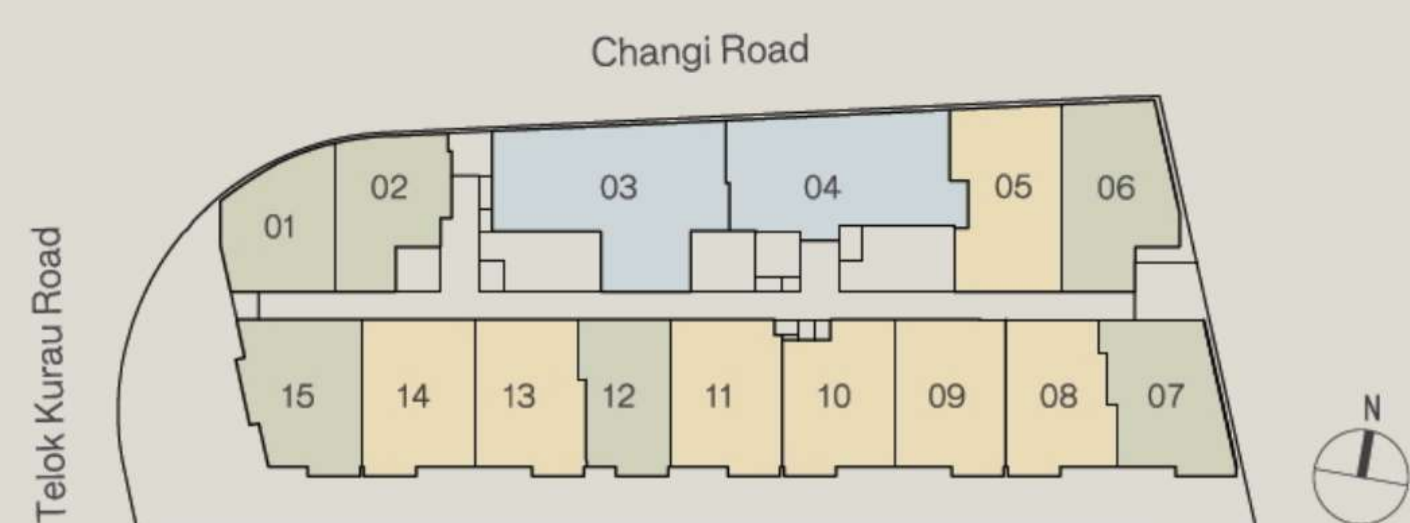
5th Storey Key Plan